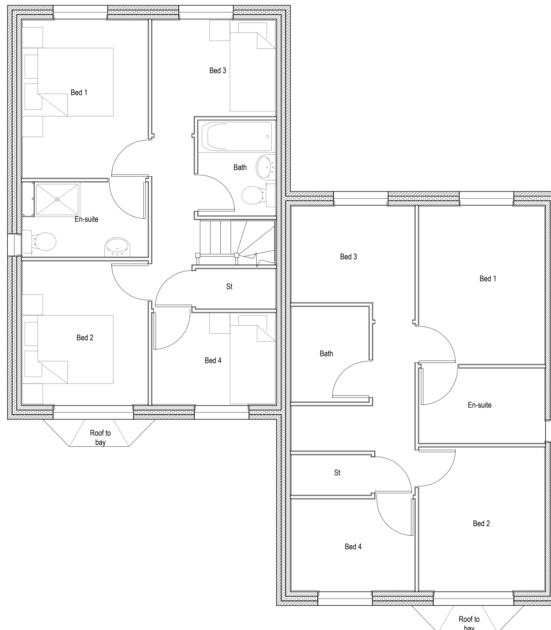
2 First Floor Plan